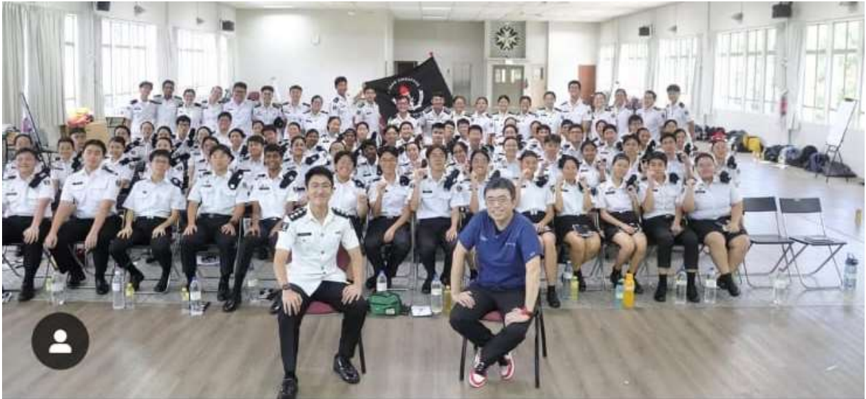
Our Prior, Priory of Singapore officiating at the Commissioning Parade held at HQ Medical Corps