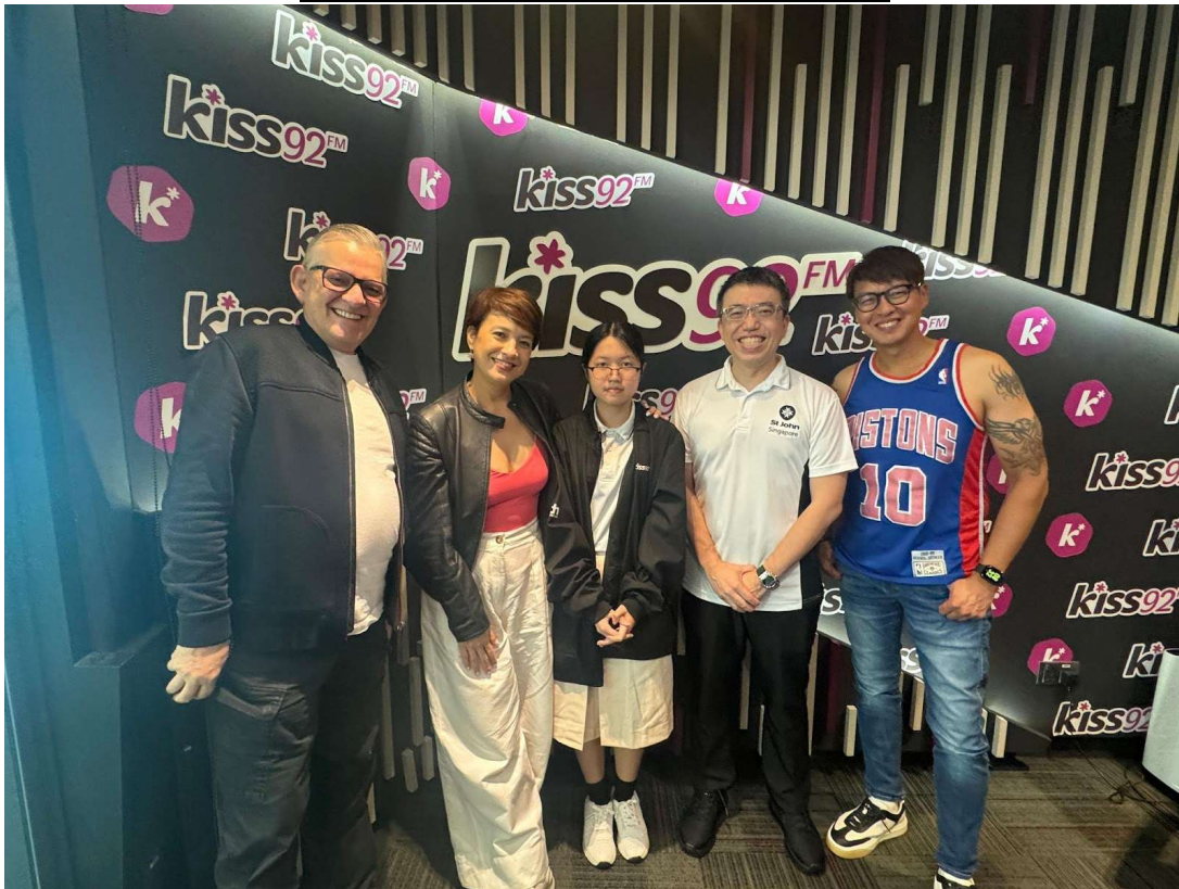
Our Cadets featured on National Radio Channels

The Brigade is constantly keeping ourselves updated on the evolving needs in the healthcare space. In recent years, there has been greater awareness on issues related to vaping, especially among the young people. As such, we collaborated with MOH to equip our cadets with awareness to act as ambassadors to bring key messages relating to these issues to our peers. This year, four selected cadets had the opportunity to go on radio (95.8FM and Kiss 92) to share their schools' efforts as part of St John's Anti-Vaping Campaign.