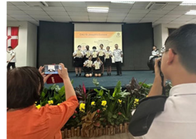
Proud recipients of the Chief Commissioner Badge enjoying their moment on stage

The highlight of the day was seeing schools and cadets receive Corps Achievement Award trophies, Chief Commissioner badges, as well as appointment letters for new Basic Drill, Corps Home Nursing and Corps First Aid Instructors.