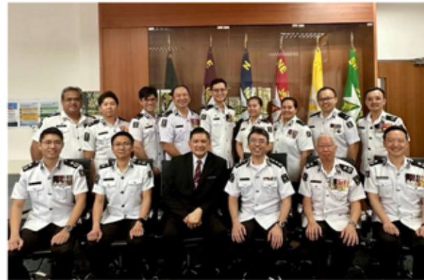
Members of the new BMC, with Council Chairman and Department Heads gracing the event