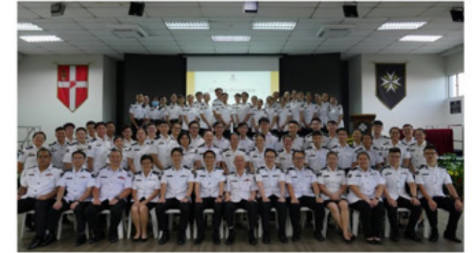
Proud promotees and graduates from the ADI and RIC with the Brigade Leadership

In the afternoon, we recognised those who had received promotions, as well as those who had graduated from the Advanced Drill Instructor (ADI) and Responder Induction Courses (RIC). We celebrate them, not just for their new ranks but even more so for the values like integrity and kindness that they embody.