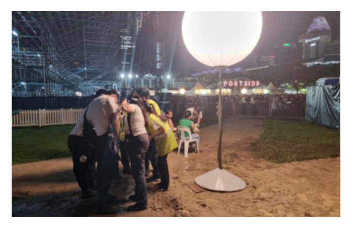
The team at Concert FAP huddling for team briefing. Ground conditions were not ideal due to the heavy rain earlier.

The SGP F1 has always been close to the hearts of racing fans across the world, but the beloved event was suspended at the onset of the COVID-19 pandemic. It has returned this year, to be the largest one held in Singapore ever.