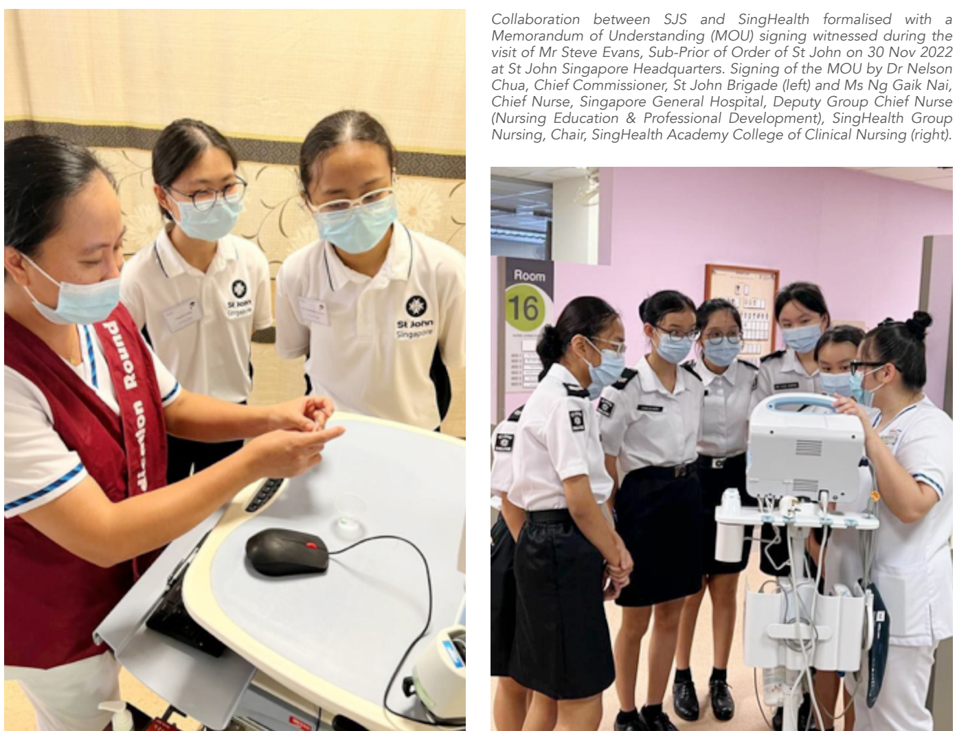
SJS cadets working with nursing professionals from Singapore General Hospital as part of the Hospital Attachment Programme. There are a total of 36 SJS cadets who were attached to Singapore General Hospital from 28 Nov 2022 to 2 Dec 2022.

This year, 124 SJS cadets had the opportunity to directly experience the delivery of nursing care under the guidance of nurse preceptors at 6 public hospitals, 1 centre and 1 community hospital. The cadets had 5 days of hospital attachment from 21 Nov 2022 to 16 Dec 2022. This immersive experience was thoroughly enjoyed by the cadets who gleaned many insights. The students had a rewarding and positive experience.