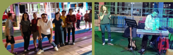
SJ Fellowship members enjoying a fun-filled pool side party at CherryLoft Resort earlier this year.